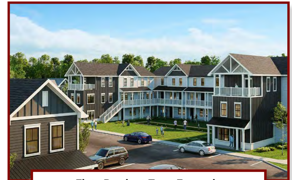
Flats Product Type Example