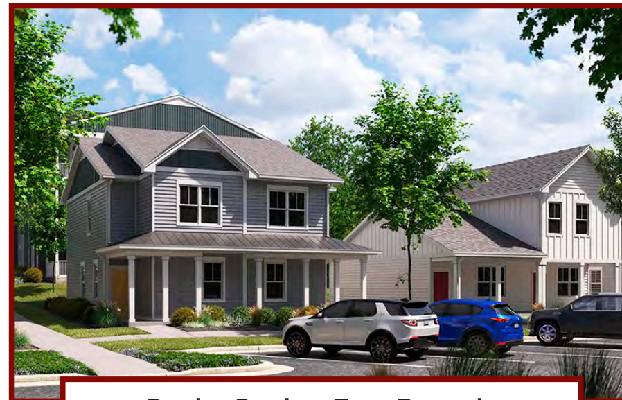
Duplex Product Type Example