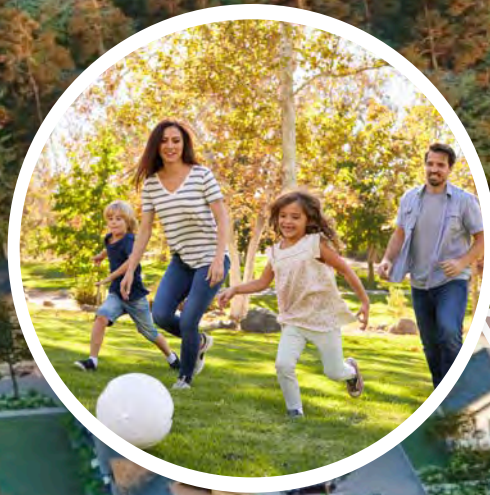
Open Green Space