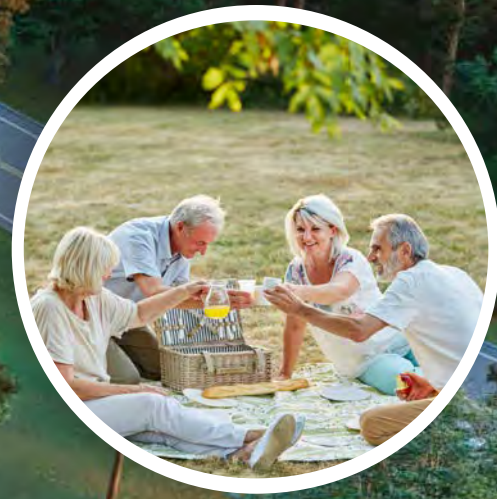
Community Gathering Space